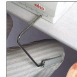
The Elna EnVision CE20 knee lifter leaves both your hands free.