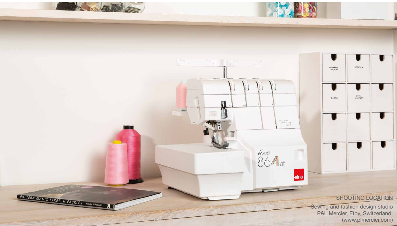
SHOOTING LOCATION Sewing and fashion design studio P&L Mercier, Etoy, Switzerland. (www.plmercier.com)

We launched our eXtend 864air to offer you a totally smooth overlocking experience. This superior model features both exceptional capabilities and solutions for super-easy threading. You can relax, start your project in no time and fully enjoy all the benefits of an overlocker.