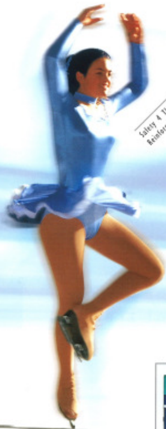
Safety 4 Thread Reinforced Seam