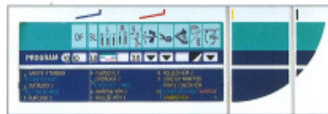
Program Display Panel

The judges have reached a decision and the result is a perfect 10. Look to the program display panel for all the information you need – differential feed, stitch length, needle position, cutting width, movable cutting blade position, etc.