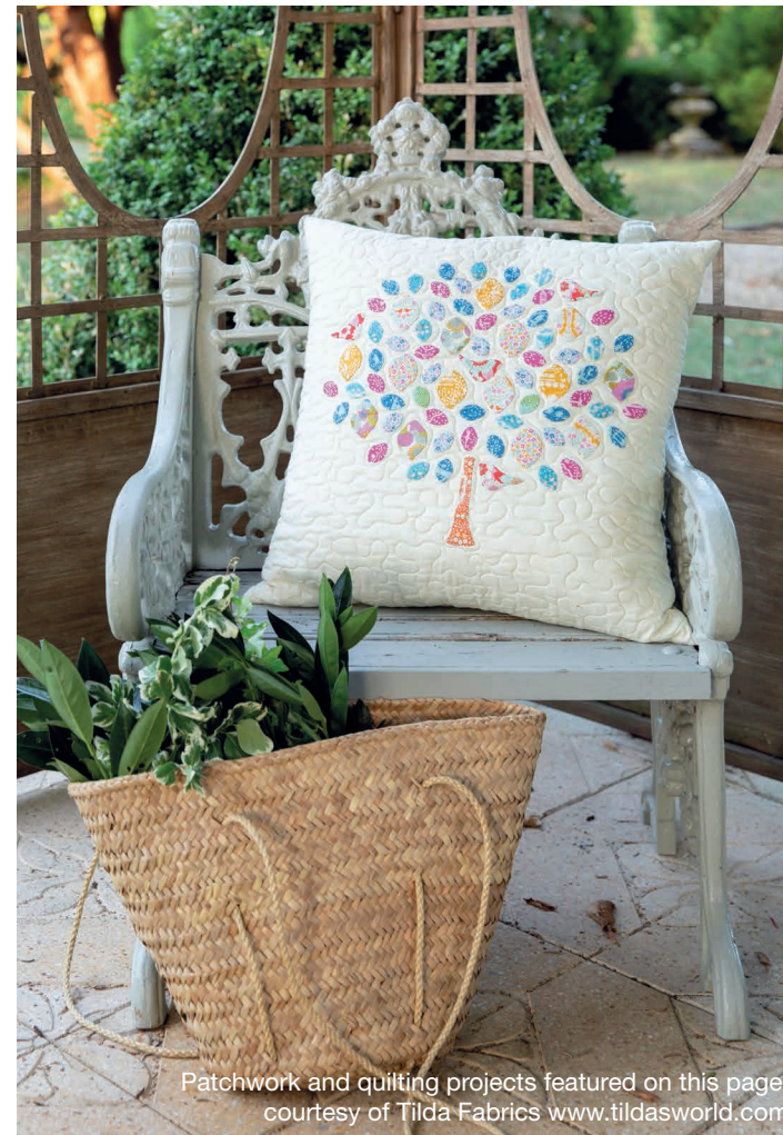
Patchwork and quilting projects featured on this page: courtesy of Tilda Fabrics www.tildasworld.com