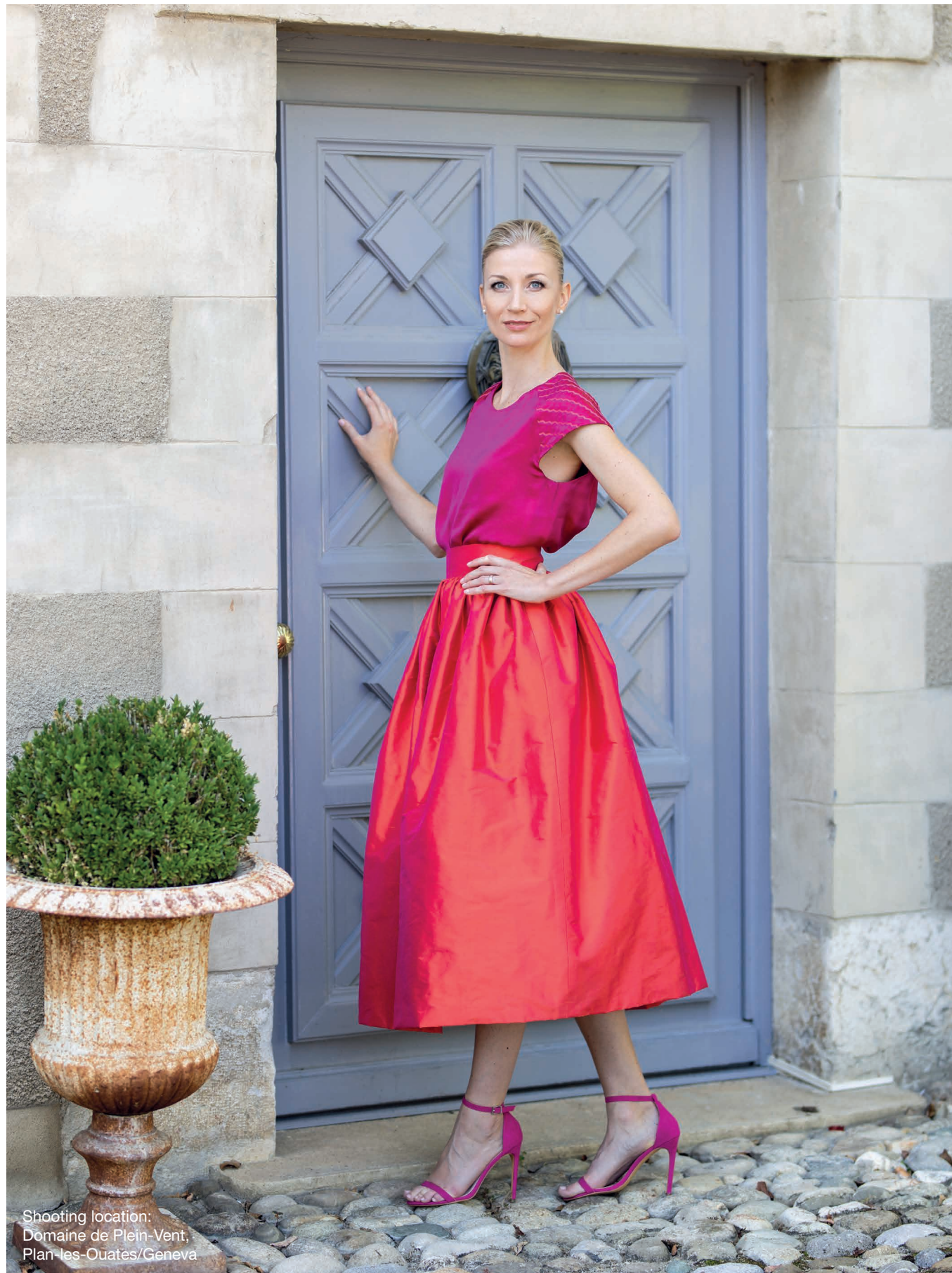
Shooting location: Domaine de Plein-Vent, Plan-les-Ouates/Geneva